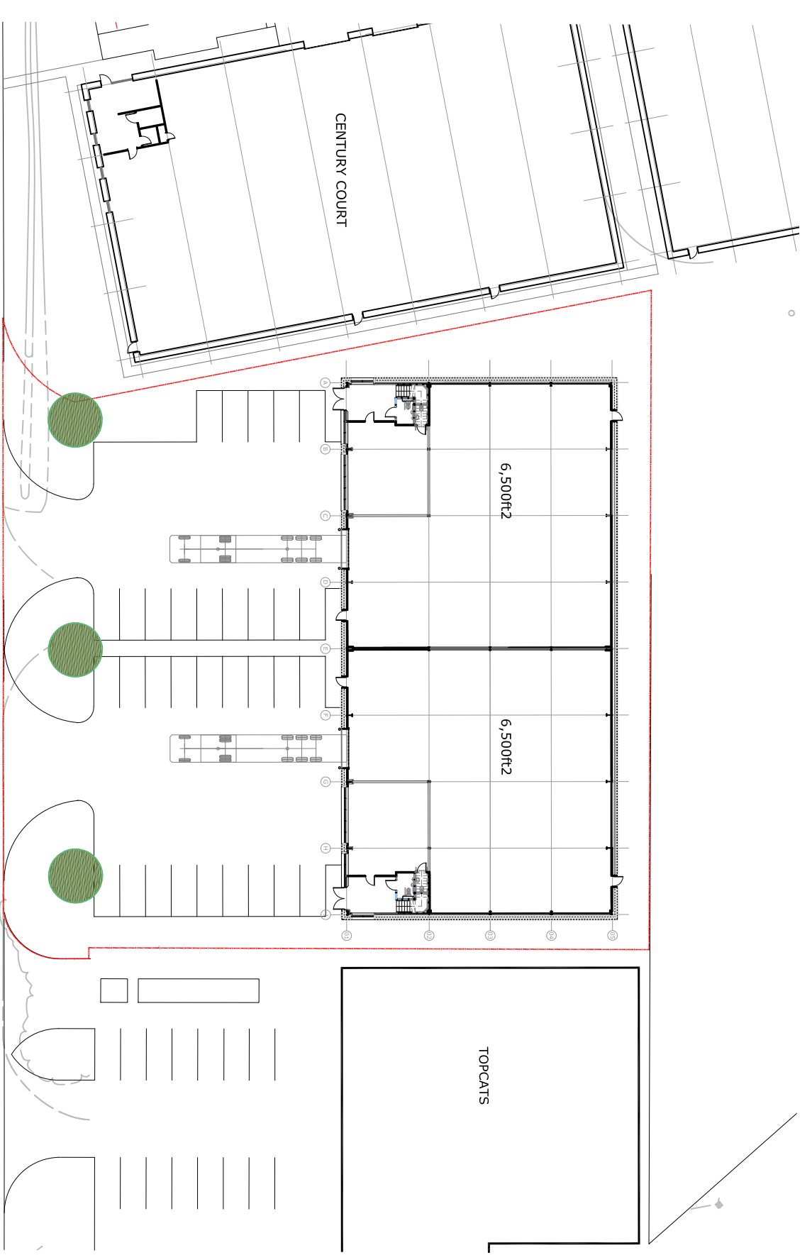
SITE LAYOUT PLAN 1:200