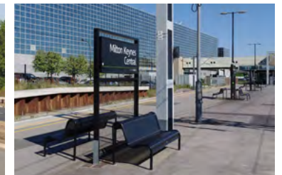
Milton Keynes Central - 3 miles

DISCLAIMER: The Agents for themselves and for the vendors or lessors of the property whose agents they are give notice that, (i) these particulars are given without responsibility of The Agents or the Vendors or Lessors as a general outline only, for the guidance of prospective purchasers or tenants, and do not constitute the whole or any part of an offer or contract; (ii) The Agents cannot guarantee the accuracy of any description, dimension, references to condition, necessary permissions for use and occupation and other details contained herein and any prospective purchasers or tenants should not rely on them as statements or representations of fact but must satisfy themselves by inspection or otherwise as to the accuracy of each of them; (iii) no employee of The Agents has any authority to make or give any representation or enter into any contract whatsoever in relation to the property; (iv) VAT may be payable on the purchase price and / or rent, all figures are exclusive of VAT, intending purchasers or lessees must satisfy themselves as to the applicable VAT position, if necessary by taking appropriate professional advice; (v) The Agents will not be liable, in negligence or otherwise, for any loss arising from the use of these particulars. 10.16.