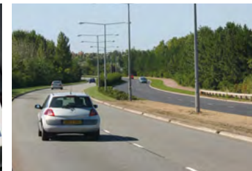
Direct and easy access to M1 and A5