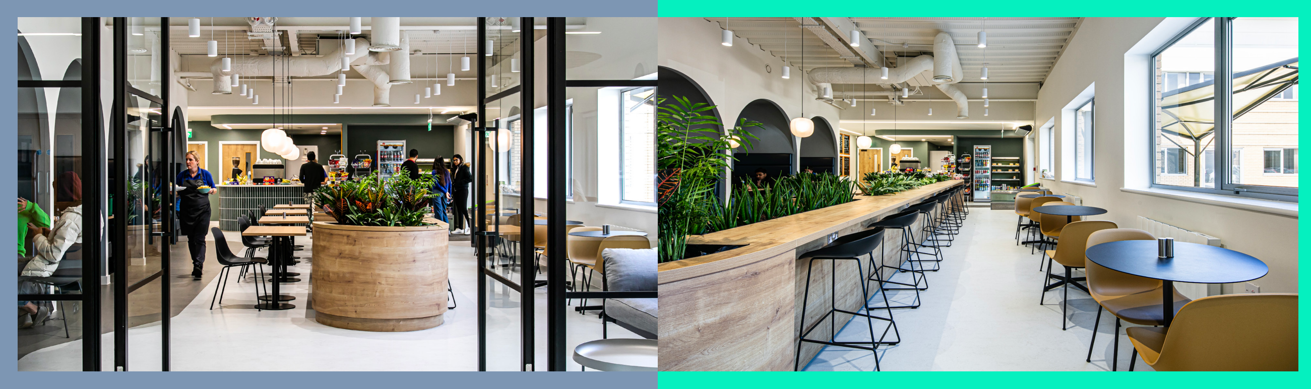
Our newly remodelled café serves hot and cold food and is of a high standard.

Join us at the Cranfield Innovation Centre and we will help you to unlock your full potential and achieve your business goals.