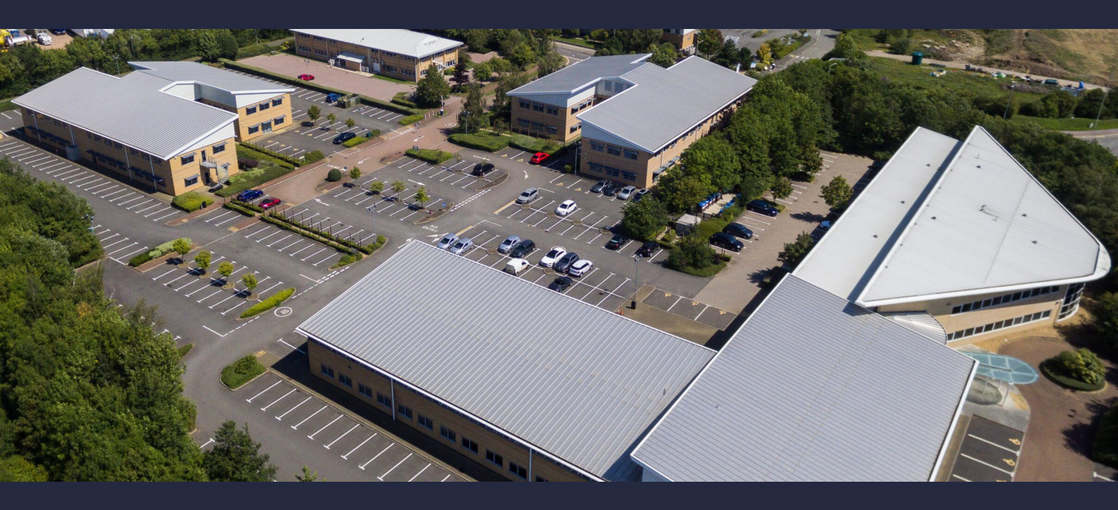
Aerial view of Cranfield University Technology Park

International connections are in easy reach as Cranfield has its own private airfield and is also a short drive from London Luton Airport.